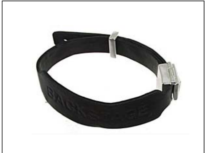
Style No. NYB07 Description: Nylon black embossed leather "BACKSTAGE" bracelet with silver plated clasp.