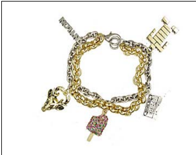
Style No. NYB06 Description: Nylon antiqued gold and silver plated bracelet featuring "NYLON," cassette tape, deer head, and multi-colored popside, lego robot charms. Bracelet is 7.5" long with a lobster clasp closure.