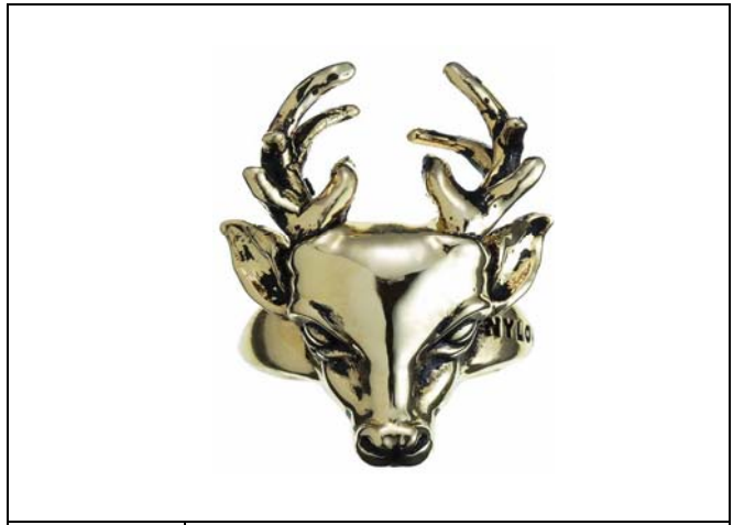
Style No. NYR03 Description: Nylon antiqued gold plated ring featuring oxidized brass deer head with antlers. Ring sizes include 7, 8, 9.