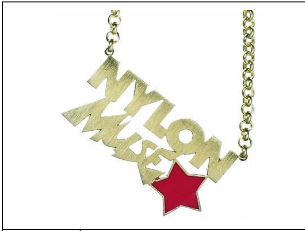
Style No. NYN21 Description: Nylon brushed matt gold plated necklace featuring NYLON MUSE logo with magenta enamel star on a 17" chain with 3" extender and lobster clasp closure.