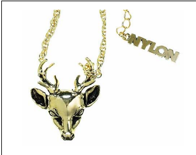
Style No. NYN17 Description: Nylon antiqued gold plated necklace featuring deer head with antlers on a 18" rope chain with 3" extender and lobster clasp closure.