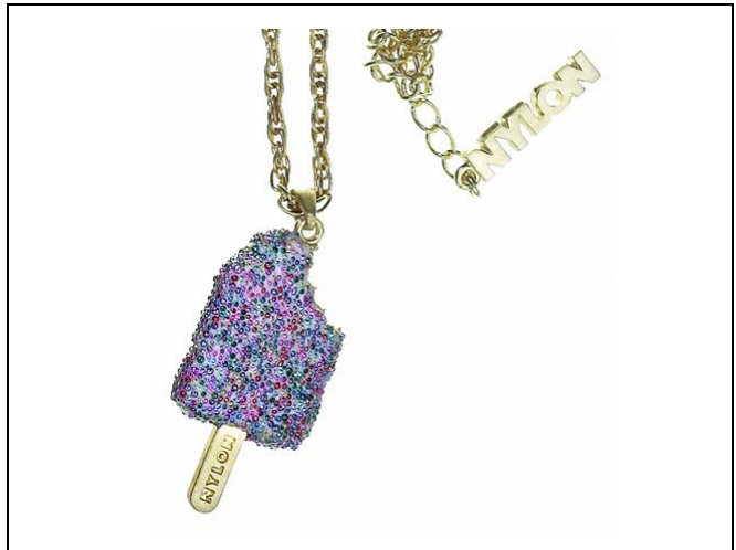
Style No. NYN18 Description: Nylon brushed matt gold plated necklace featuring multi colored glass bead popside with a bite mark and NYLON logo on the popside stick.